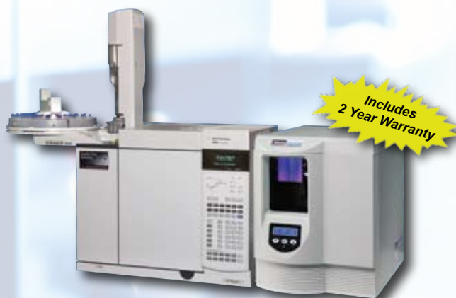
Model H2PEM Hydrogen Generator with Agilent 7890 GC-FID