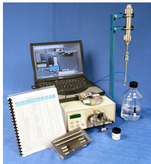
Complete column-packing system — Plug in and go! Plus: Free software for optional PC control!

Chrom Tech now offers a full line of electric dual-head, constant pressure pumps for a wide range of column packing applications. These pumps offer the complete range of control and pressure options for packing new small particles (1-micron–10-micron) and soft, pressure sensitive polymeric materials. Packing process advantages include: