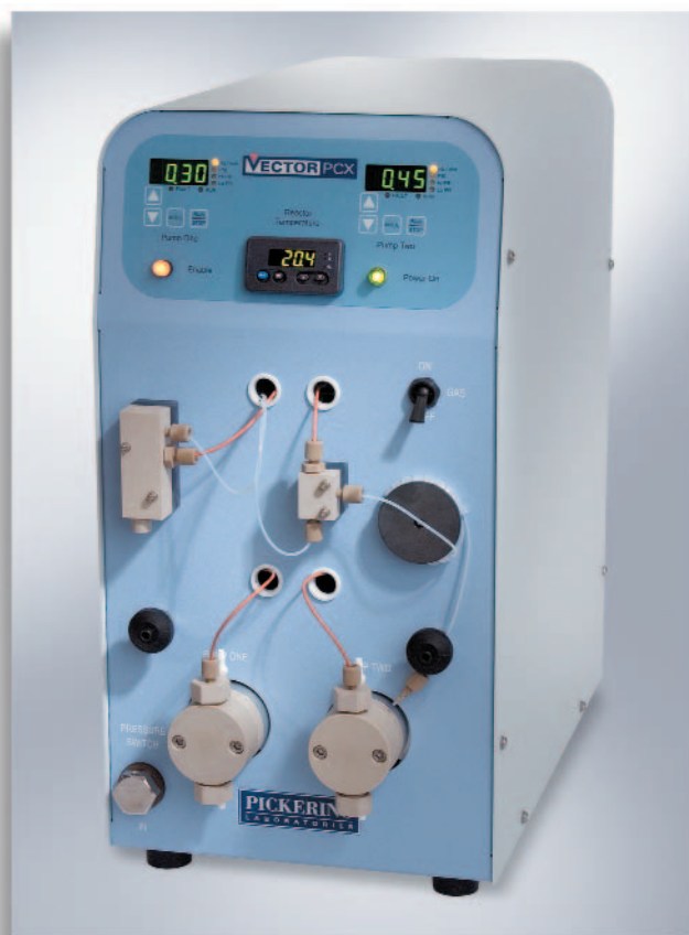
Vector PCX provides easy access to fluidics and simple operation.

A relief valve pre-calibrated to open at 35 bar (500 psi) prevents rupture of the post-column reactor tubing in the event of downstream blockage, and reduces the possibility that all or part of the reagent flow will be diverted to the column