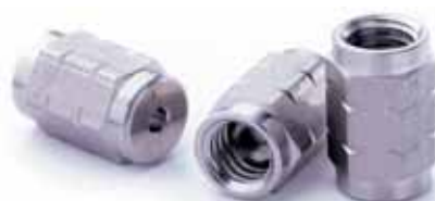
SilTite nuts with the distinctive two notches.