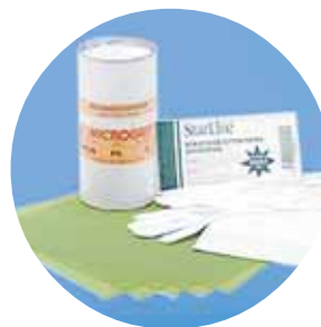
Cleaning and Maintenance Supplies