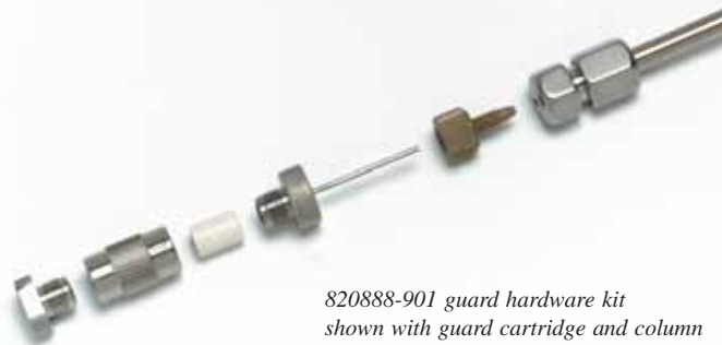
820888-901 guard hardware kit shown with guard cartridge and column